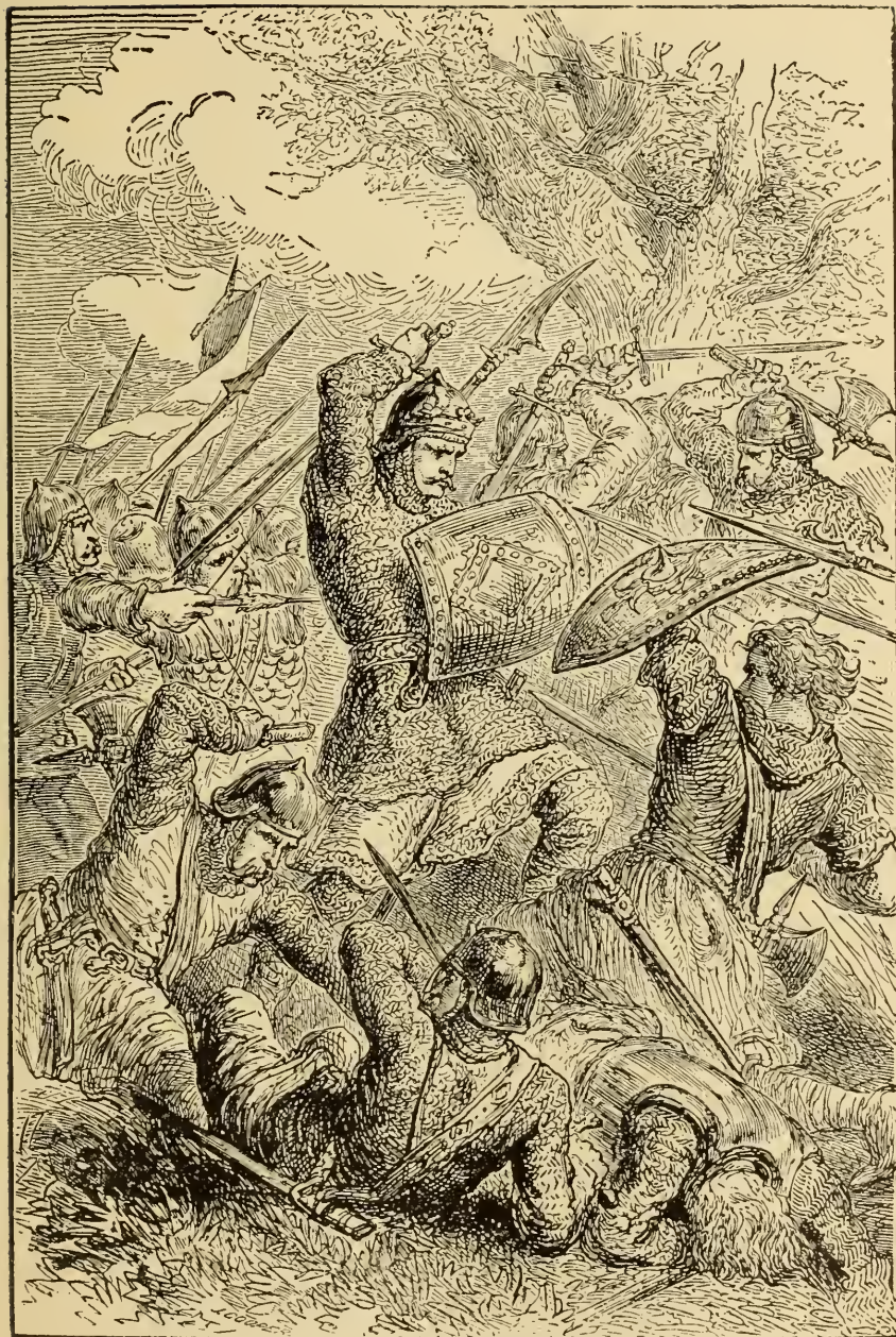
Alfred leading his men at the battle of Ashdown.—Page 82.